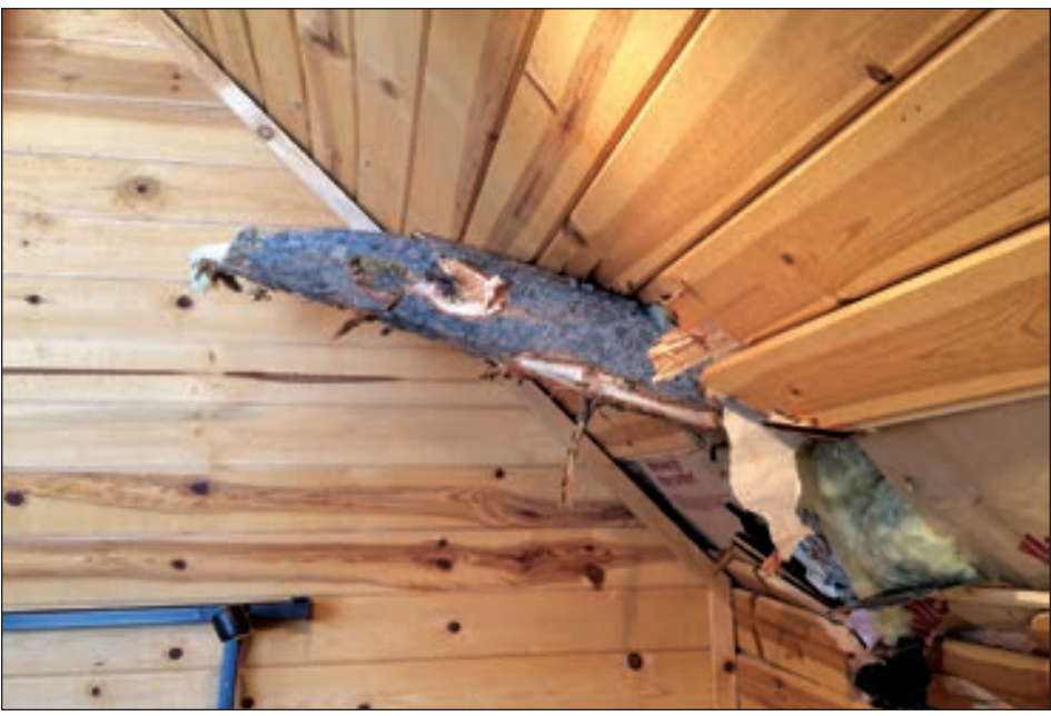
Winter home damage comes in interesting packages as illustrated above with a roof impalement by a falling tree.

Welcome to CATT, the Contractors Association of Truckee Tahoe. We give you direct access to experienced and reliable designers, contractors, and suppliers so your construction or remodel project is handled by the best our region has to offer.