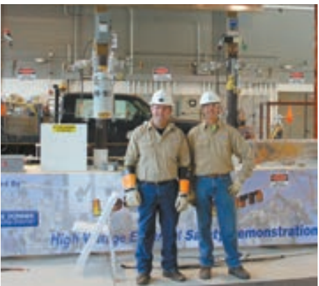
The Truckee Donner PUD staff presents a very educational demonstration about electricity on Saturday and Sunday.